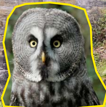
Great Grey Owl