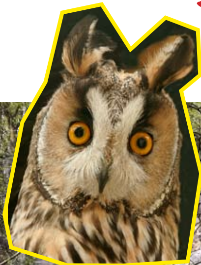
Long Eared Owl